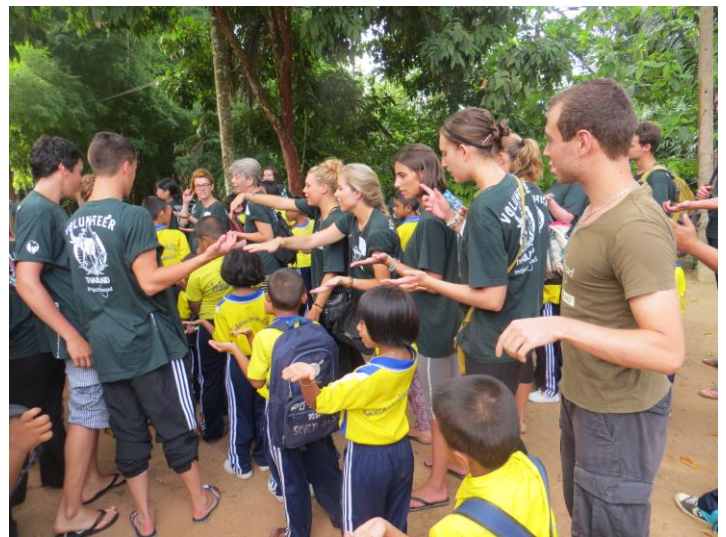
Volunteers play outdoor game with the kids