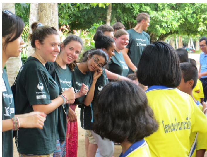
Our two weeks special volunteers