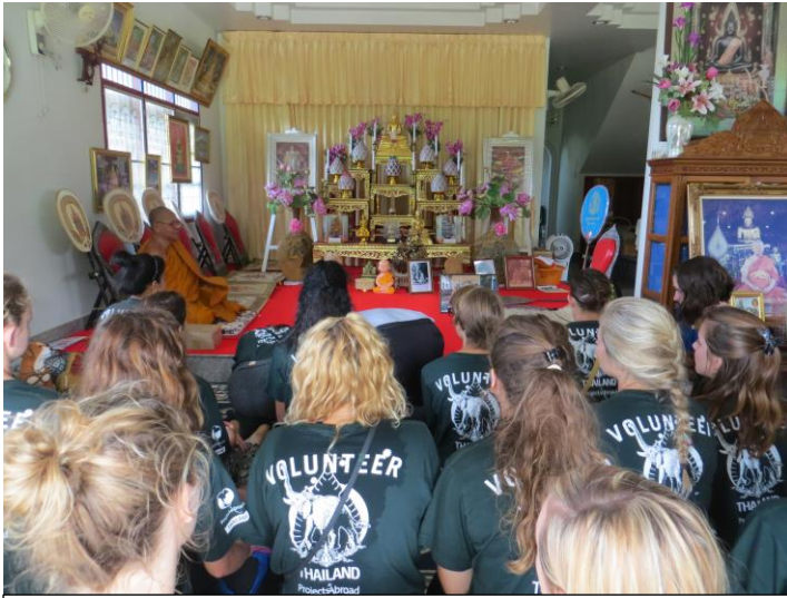
Volunteers are blessed by the monk