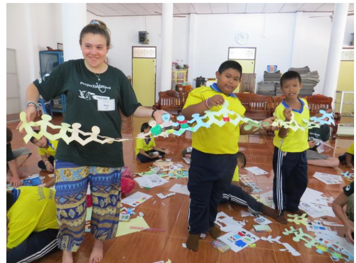
One of our 2WS made paper dolls with children