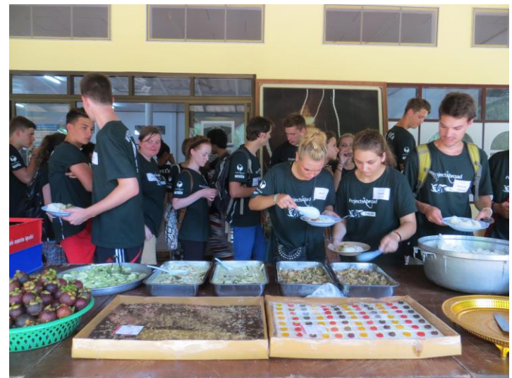
Volunteers having lunch at the temple